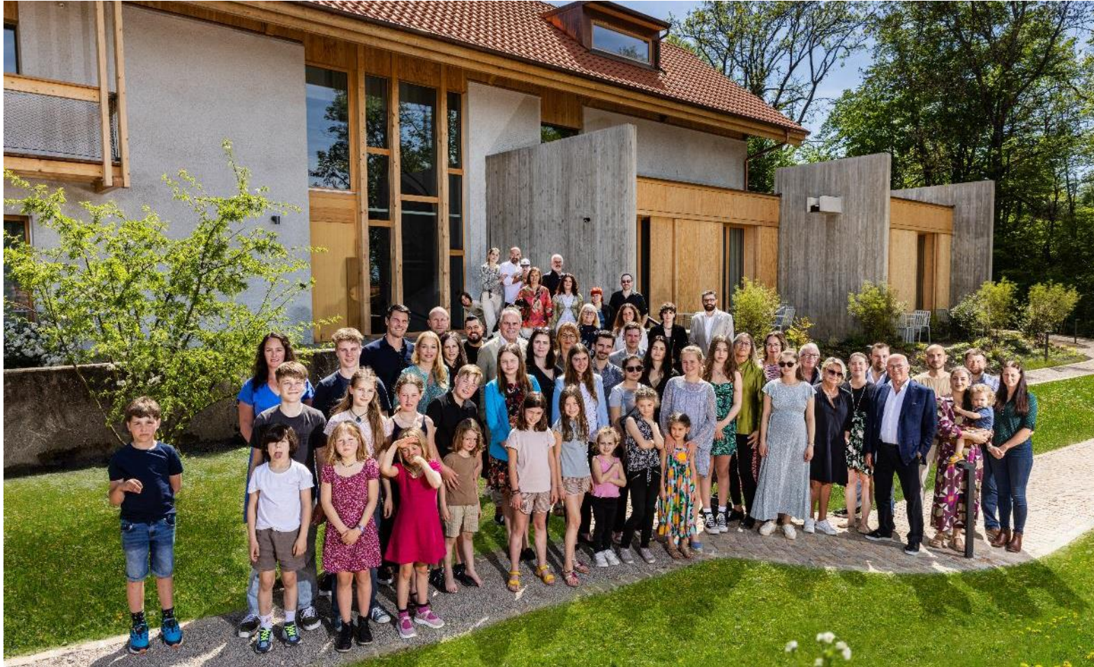
The Endress family in 2024